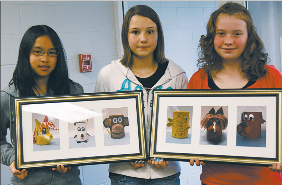
During the Cambridge-Isanti School Board meeting April 22, students from the School For all Seasons, Isanti Primary, Isanti Intermediate, Isanti Middle, Minnesota Center, Cambridge Primary and Cambridge Intermediate schools presented artwork they created.